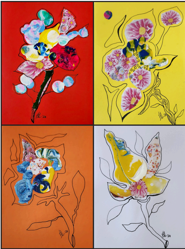
Fil Angelakis, “Spring Floral Collage”, Mixed Media,