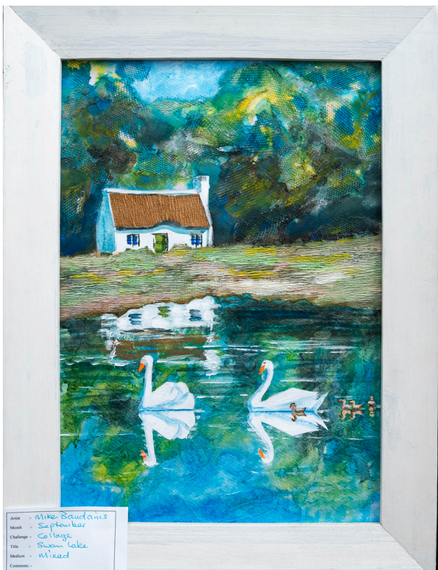
Artist - Mike Baudains Month - September Challenge - Collage Title - Swan Lake Medium - Mixed Contents -