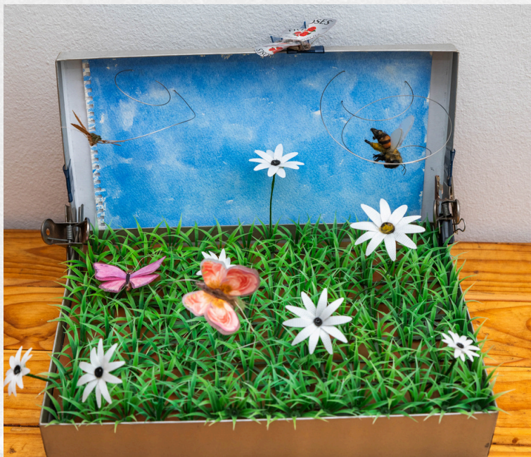
Sonja Rivett-Carnac, "Spring in a Box"