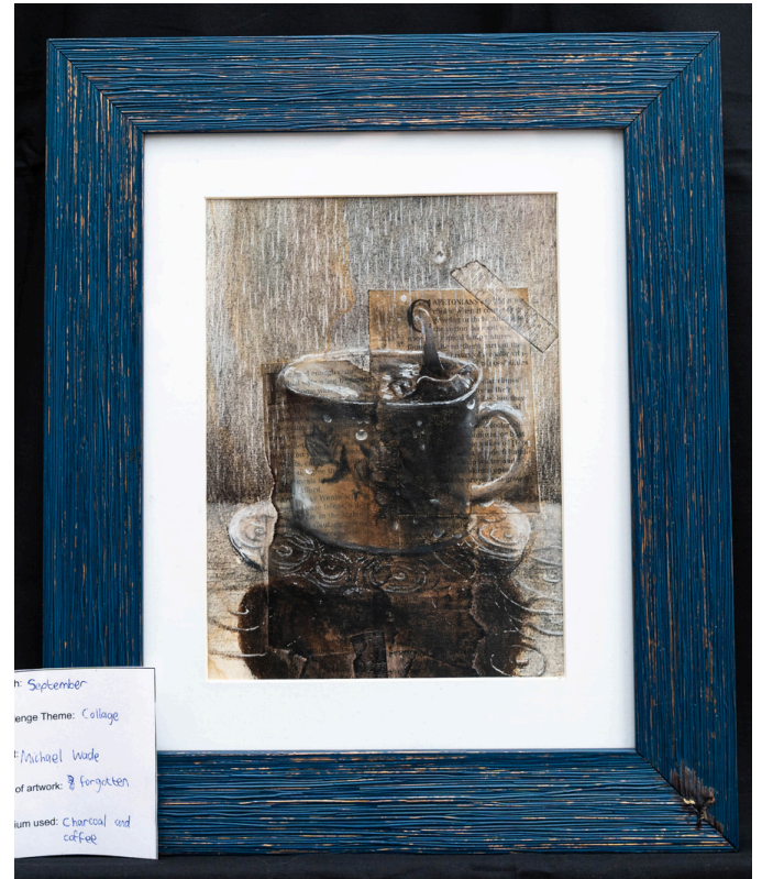
September Challenge Theme: Collage Michael Wade Title of artwork: Forgotten Medium used: Charcoal and coffee